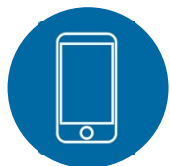
SMS text message*

Cardholders can enroll to receive notifications via any, or all of the following methods: